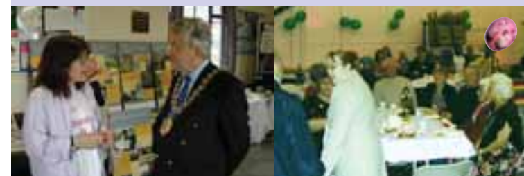
Coventry's mayor visits last year's Willenhall Festival.

We continue our focus on residents' groups, and in this edition, it's the turn of the Willenhall Tenants & Residents Association.