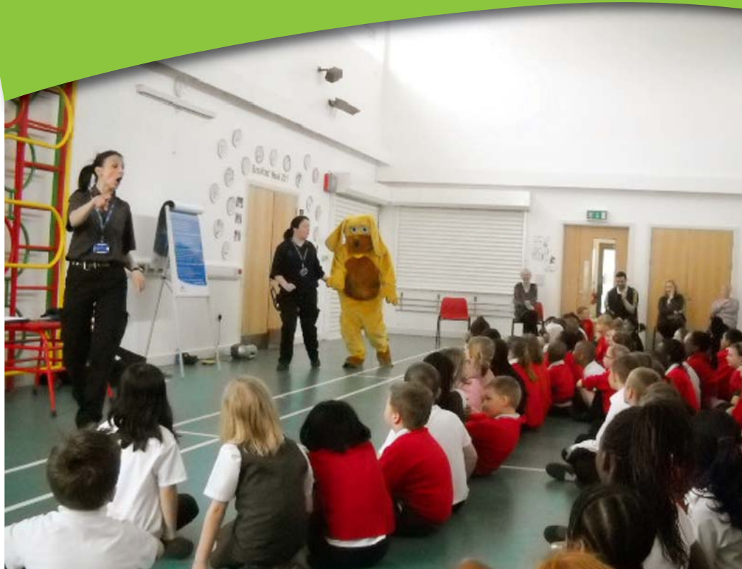
Students at Willenhall primary school assembly about road safety and dog awareness.