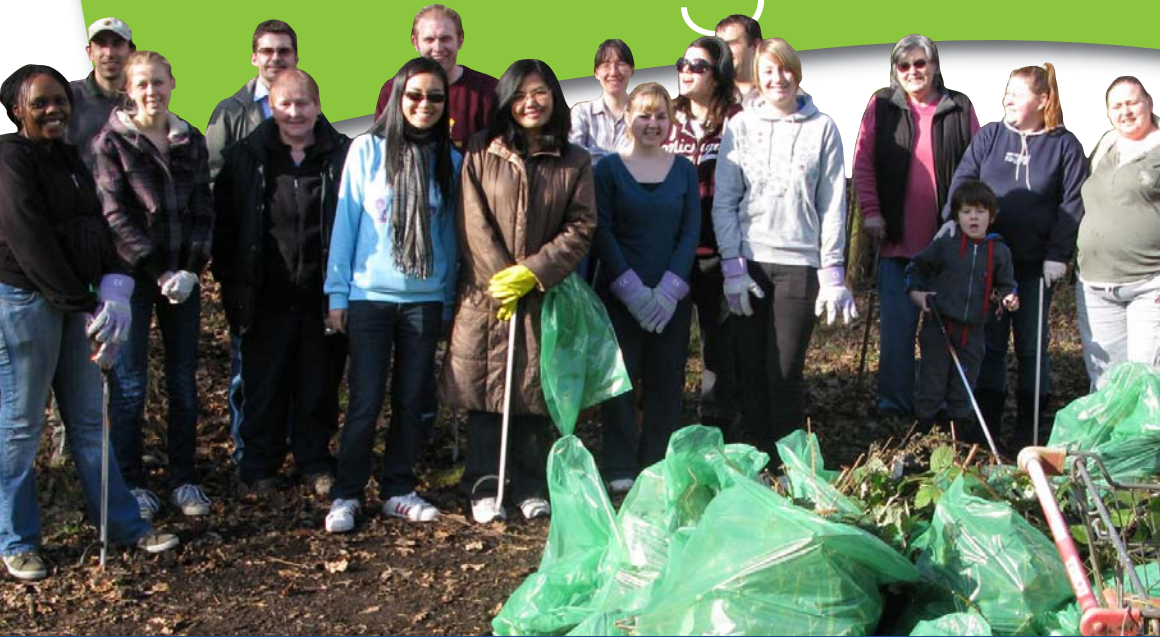
Warwick Volunteers and Friends of Canley Green Spaces at site clearance of Henry Parkes Woodland.