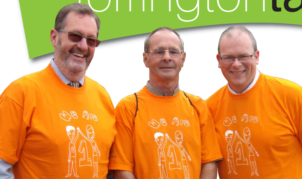
Getting into the spirit